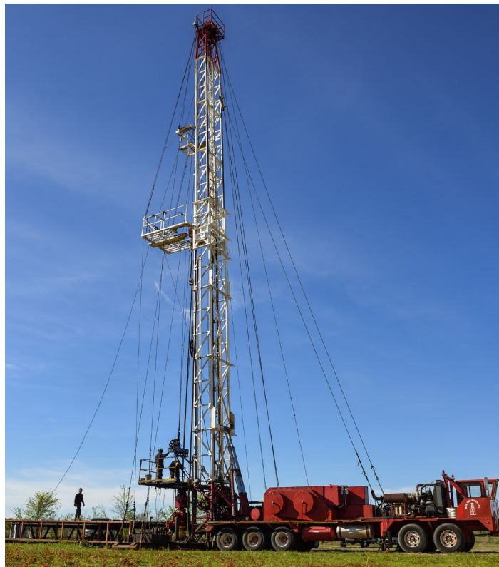
High-efficiency PowerSave ESPs typically reduce electrical consumption by 30% or more.

The producer stopped production on the well in November and scheduled the Novomet crew to install the new PowerSave system in mid-December. We pulled the old equipment and installed a 406 series PowerSave ESP in the target well. We set the ESP where the previous system had been installed at 3,839 ft (1170 m) total depth in 5.5-in. casing.